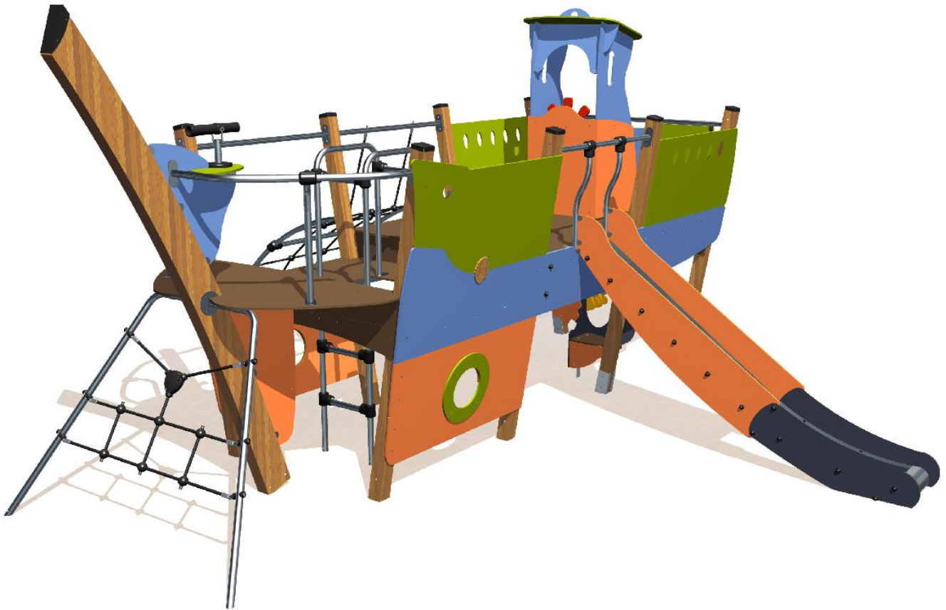
Caption: Some ideas starters to get people thinking about how Ulmarra's Bailey Park might be redeveloped.