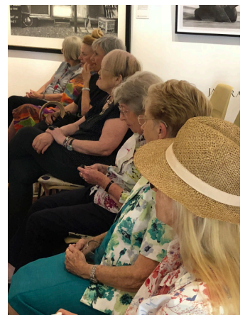
Above: Grafton Regional Gallery volunteers