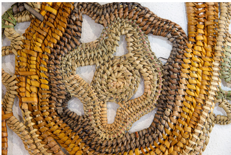
Above: Kylie Caldwell Our Mountains Have a Story 2020

Come Around, Lost or Found, 2014 Mixed media assemblage