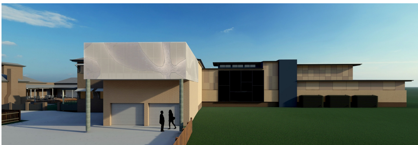
Above: Artist impression, gallery redevelopment

The gallery was able to present a stimulating program of creative activity that celebrated the amazing talent found throughout the Clarence during 2020. Due to COVID-19 many of the Gallery's public programs and events were presented in a digital format which offered an exciting opportunity to reach new audiences from a wider footprint across Australia. During the mandatory shut down the gallery was able to refocus energy into developing a variety of online creative resources to suit all ages.