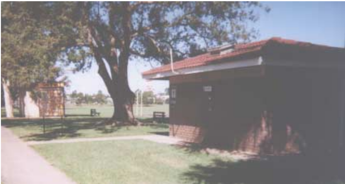
Plate 11: Toilets, Civic Guide, seating and shade form part of Precinct 3.