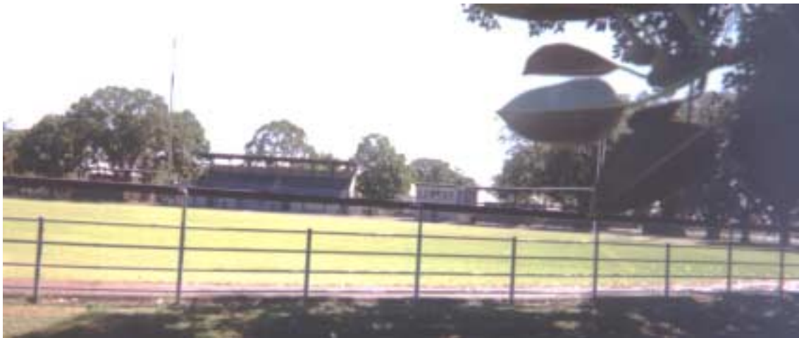
Plate 1: McKittrick Oval - organised recreation, social, heritage and economic values