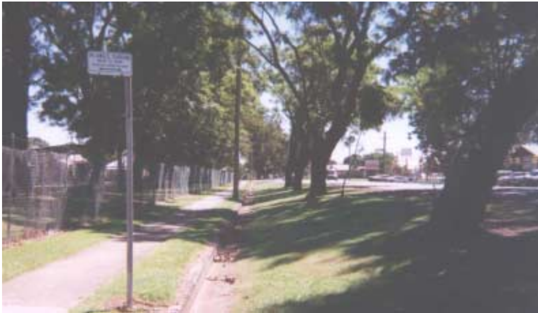
Plate 8: Existing parking areas, located adjacent to Ryan Road.

Management Direction - Consider development of Vere Street reserve, south of the park, as a car parking area to remove the majority of manoeuvring vehicles from adjoining streets during busy periods