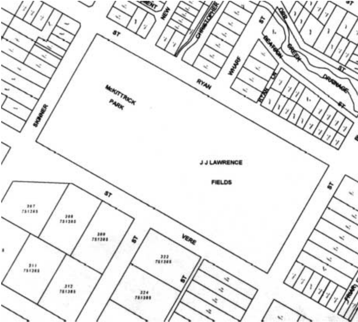
Map 1 – Location of McKittrick Park