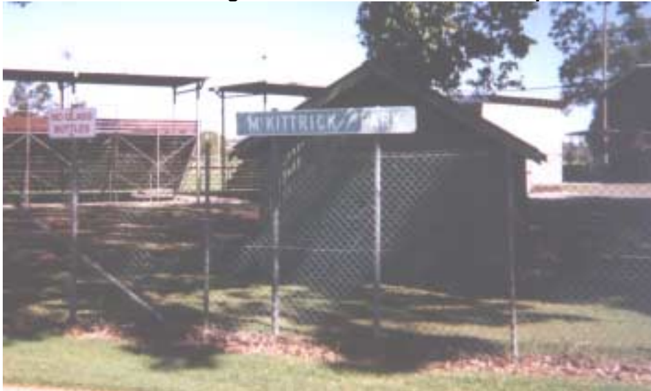
Plate 7: McKittrick Oval fencing and structures has a visual impact on streetscape.

Management Direction - Upgrading of entrance to McKittrick Park, and provision of more shade trees and landscaping of the park perimeter, to promote “village green” feeling