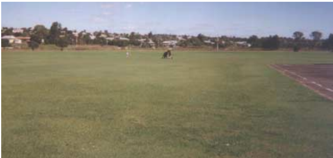
Plate 10: JJ Lawrence Fields, showing open vistas and use for walking through.