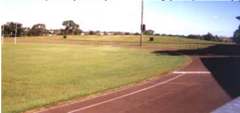
Plate 4: The close proximity of the cycle track and rugby field poses safety issues

Management Direction – Council investigate a suitable location for a 1km criterium racing facility, with the potential for a flat track space within this area for future development - the existing cycling track around McKittrick Oval be removed to improve flexibility for user groups, and if possible an area be identified for construction of suitable cycling facilities