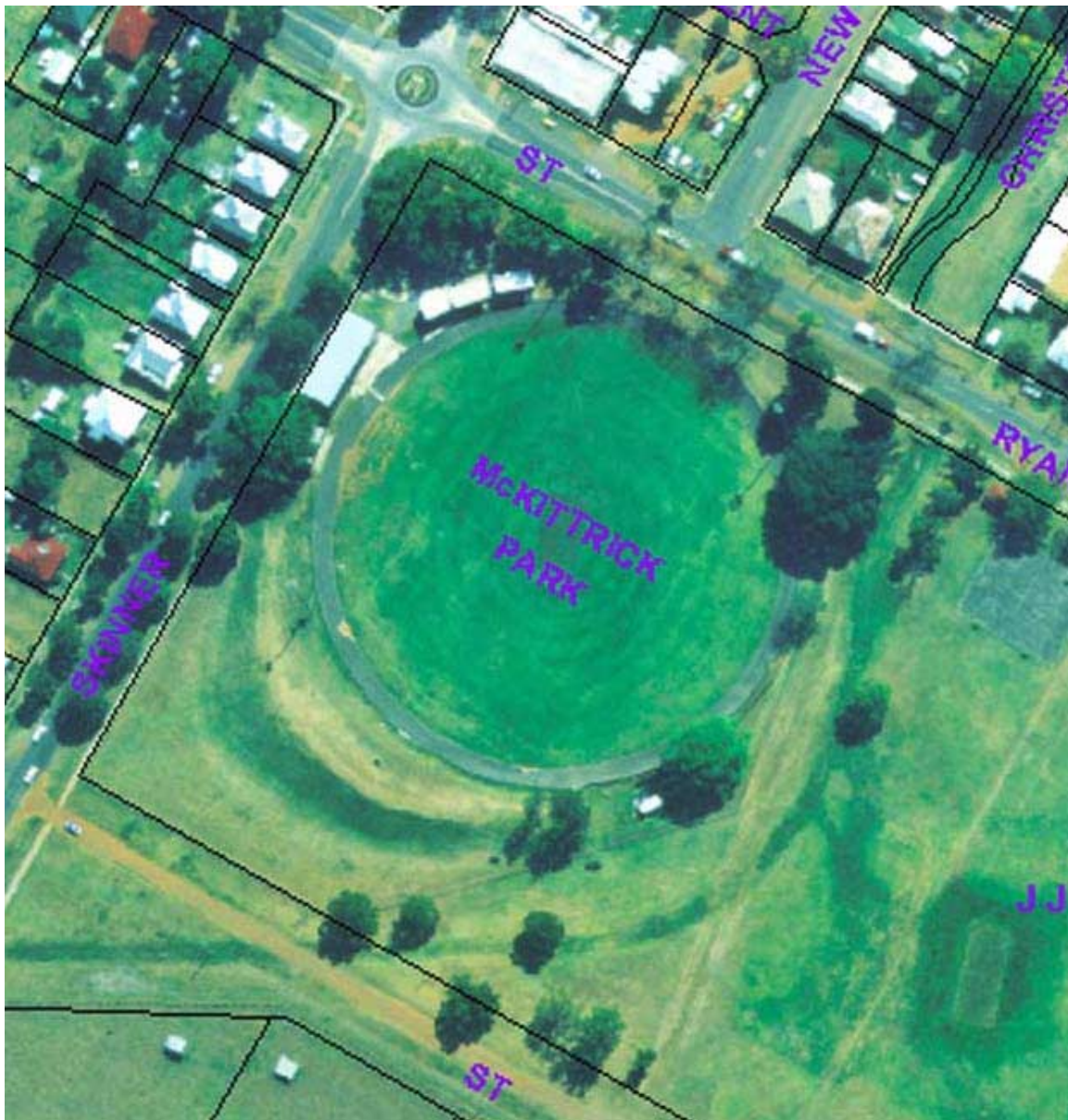
Plate 2: Aerial photography showing the key elements of McKittrick Oval

McKittrick Park consists of two key areas, being the formalised McKittrick Oval surrounded by a cycle track, fence and grandstand facilities and the open JJ Lawrence Fields. These two key areas are traversed by a modified waterway, used for the drainage of Christopher Creek, and the fields also provide a drainage and ponding function during major rain and flood events. A number of facilities for general community use, such as basketball courts, toilets, seating, and picnic/BBQ areas are located along Ryan Street. The facilities and layout of each area is detailed in Section 3.2 - Precinct Plan.