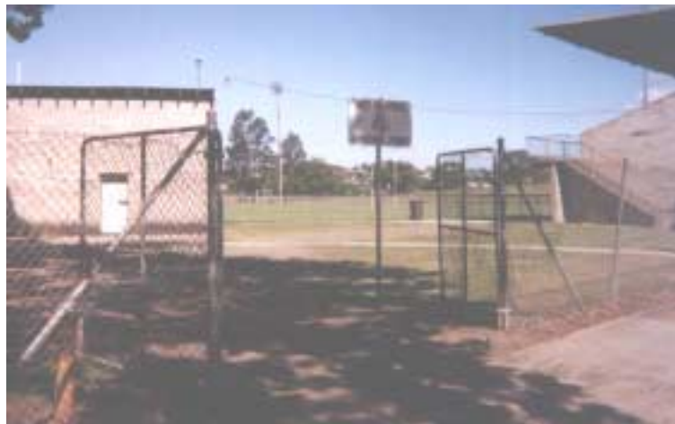
Plate 9: Entrance to McKittrick Oval, showing amenity of structures and fencing.