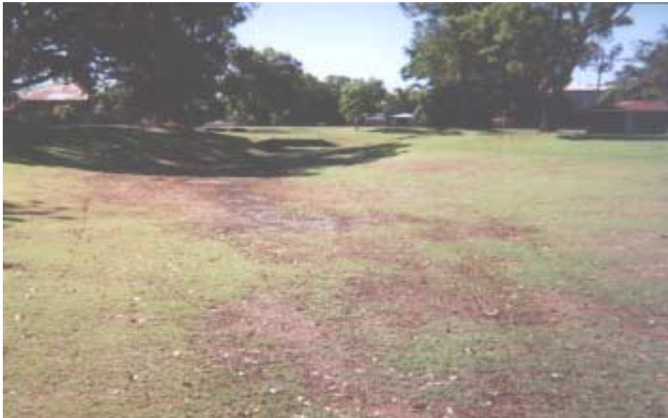
Plate 5: Waterway, showing effects of ponding caused by the March 2001 flooding.

– that the ponding concerns be acknowledged and potential drainage inadequacies in addressed in future improvements and maintenance - the ponding function of the fields be retained.