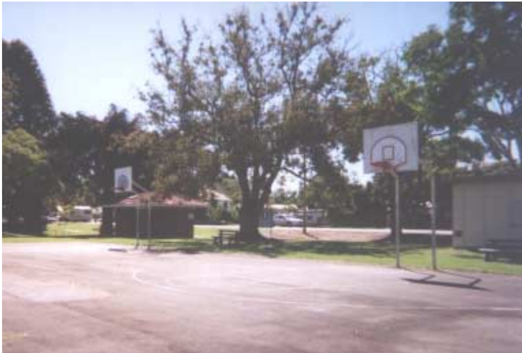
Plate 6: The basketball courts, showing toilets, seating and shade in background.

Management Direction – Promote the greater use of McKittrick Park and JJ Lawrence Fields for youth activities and community-based activities, taking into account adjoining residents issues such as noise and lighting.