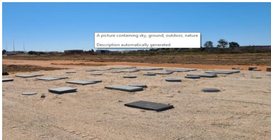
Figure 3 – Sample of Completed Installation (Site will be Turfed)