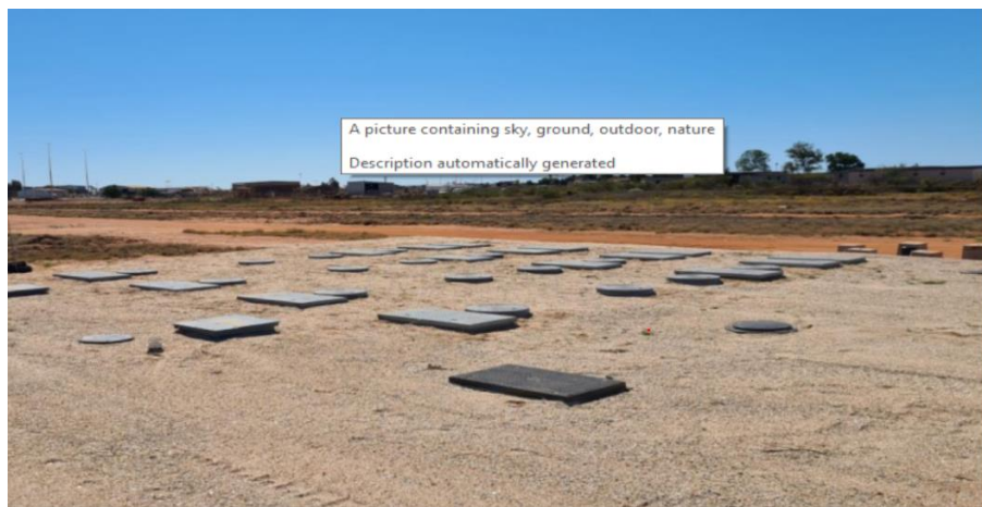
Figure 3 – Sample of Completed Installation (Site will be Turfed)