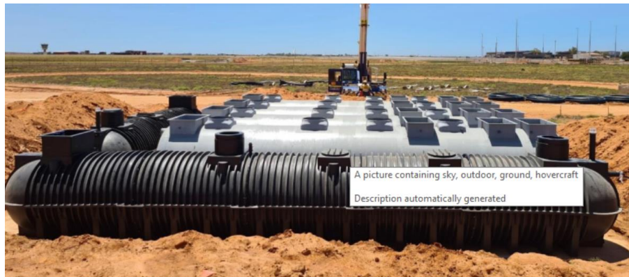
Figure 2 – Sample of Exposed Incomplete Packaged Treatment Plant Installation